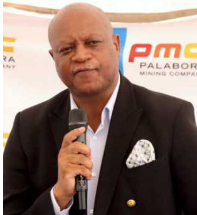
Cllr. Seaparo Sekoati (Limpopo MEC Treasury)